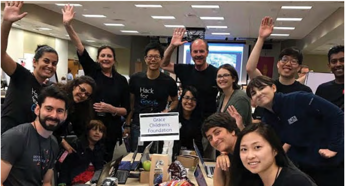
Microsoft Hack for Good, 2018 Hackathon, Microsoft Campus, Redmond, Washington