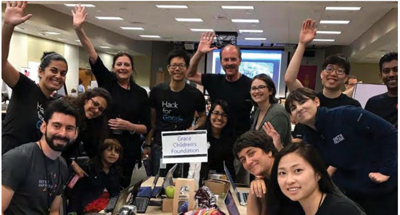
Microsoft Hack for Good, 2018 Hackathon, Microsoft Campus, Redmond, Washington